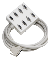
RocketPort EXPRESS 8-Port SMPTE Interface