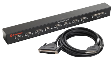
RocketPort EXPRESS 8-Port SMPTE Rackmount Interface