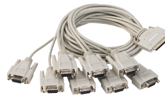
RocketPort EXPRESS SMPTE Octacable